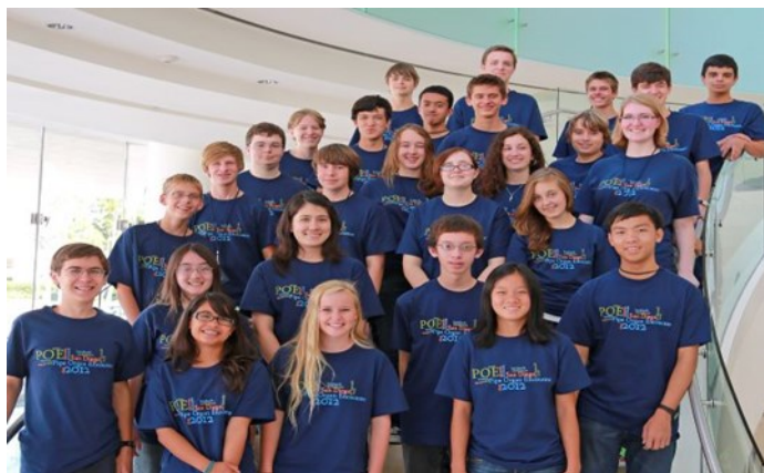
Photo from 2012 San Diego POE

POE (Technical) for ages 16-23 June 14-19 Norman, OK